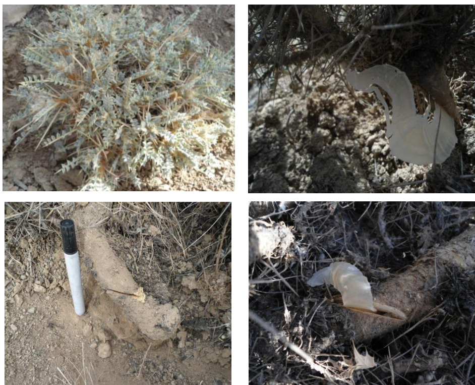
Fig. 1. The plants tapped with a knife by making careful oblique incision

Determination of total phenolic compounds. The total amount of phenolic compounds in each aqueous solution of gum tragacanth was determined using the Folin–Ciocalteu method following procedure of Singleton and Rossi [1965] with some modifications. Briefly, A 0.5 ml of the sample was mixed with 2.5 ml of Folin–Ciocalteu’s phenol reagent for 5 min at 37°C, 2 ml of saturated \text{Na}_2\text{CO}_3 (7.5%) was added, and the mixture was brought to 10 ml with the addition of deionized, distilled water. The mixture was maintained at room temperature in the dark for 120 min and then the absorbance was measured at 765 nm against a reagent blank using a Perkin-Elmer Lambda UV/Vis spectrophotometer. Gallic acid was used as the reference standard and the total phenolic content was expressed as mg of gallic acid equivalents per gram of gum tragacanth on dry basis ( \text{mg GAE}\cdot\text{g}^{-1} gum).