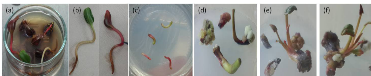
Fig. 1.a–c. In vitro germinated 14-days old R. ribes L. hypocotyls and their transfer to nutrient media; d–f. callus induction and shoot formations in Murashige and Skoog media supplemented with 4 mg/L 6-benzylaminopurine (BAP) and 0.1 mg/L naphthylacetic acid (NAA)

In vitro callus proliferation. For in vitro callus proliferation, calli obtained from hypocotyl explants were cut in 1 cm 3 pieces and cultured in MS media with four PGR combinations, including TDZ (0.5, 1, 2, and 3 mg/L) and NAA (0.2 mg/L) (experiment 1). Calli obtained from the first set of experiments (about 1.5 g