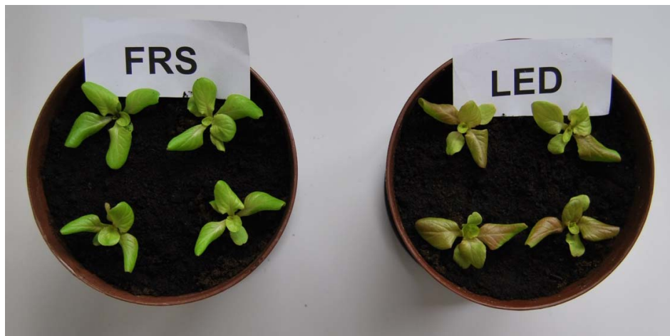
Phot. 1. 10-day lettuce seedlings in the first experiment