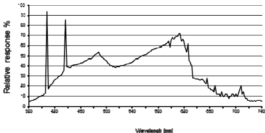
Fig. 2. Spectral distribution in relative energy of the fluorescent lamps (FRS)

In both experiments, the total N content in the leaves of plants growing under LED light was significantly higher than in the case of FRS and besides this content in the leaves at increased irradiation was higher by 0.27% compared to lower irradiation. Both in the first and second experiment, the leaves of plants additionally fed only with the ammonium form of N accumulated most nitrogen, while N accumulation was significantly lower when plants were fertilized with the nitrate form and the nitrate-ammonium form. The leaf nitrogen content in control plants was nearly half lower (tab. 4). Plants under LED light contained not only significantly more total N, but also more nitrates than those growing under FRS lamps. The high irradiation with this light promoted \text{NO}_3 accumulation in the leaves (first experiment). Regardless of the type of light used in the experiments, however, plants additionally supplied with this form of nitrogen contained most nitrates, whereas a significantly lower amount of nitrates was found in plants fed with \text{NH}_4/\text{NO}_3 and the lowest one in those fed with \text{NH}_4 . The nitrate content in the leaves of control plants was on average 3 times lower (tab. 5).