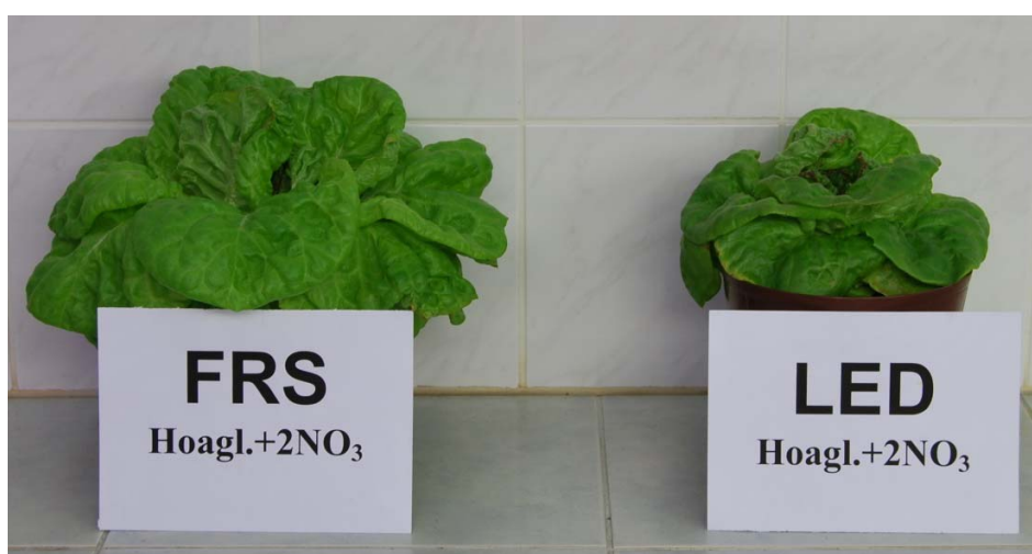
Phot. 3. 6-week lettuce seedlings in the second experiment

obtained the highest plant dry weight at the red/blue light ratio of 48/12. Cucumber required much larger amounts of blue light. Hogewoning et al. [2010] report that with an increasing percentage of blue light relative to red light from 7% to as much as 50% the photosynthetic capacity increased, which was coupled with an increase in SLA as well as in the content of pigments and nitrogen. In the light of the research on lettuce conducted by other authors [Bula et al. 1991, Okamoto et al. 1997], this seems to be the reason for the lower values of all the plant traits in question (except for the nitrate content) in the first experiment in relation to the second one.