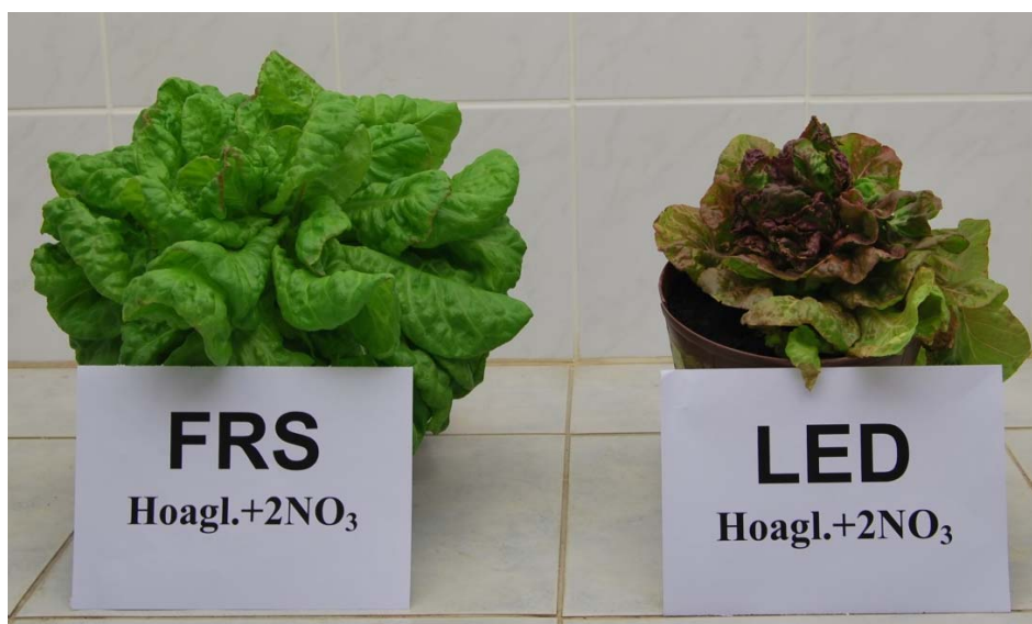
Phot. 2. 6-week lettuce seedlings in the first experiment

light. Studies conducted with LED lamps show that red light alone is unacceptable for the proper growth of lettuce [Bula et al. 1991, Barta et al. 1992]. To improve its growth, blue light supplementation is necessary [Sharkey and Roschke 1981, Bula et al. 1991, Barta et al. 1992, Hoenecke et al. 1992, Okamoto et al. 1997, Yorio et al. 2001]. However, a question arises what the ratio of red to blue light should be. Bula et al. [1991] reports that in the case of lettuce cv. 'Grand Rapids' grown under red LEDs 10% blue light supplementation was necessary for lettuce growth, while Okamoto et al. [1997]