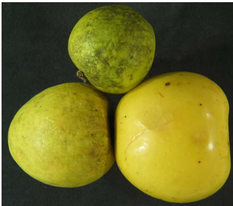
Fig. 1. Wilting effect of sooty blotch fungi on apple fruit in comparison with mycelium free skin of fruit

Rys. 1. Efekt wędnięcia owoców pokrytych grzybnia grzybów kompleksu brudnej plamistości w porównaniu z kontrolą