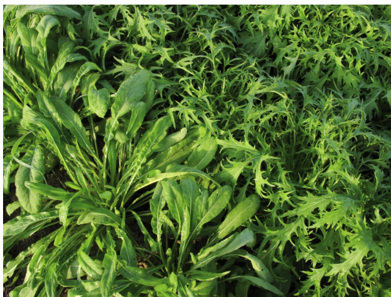
Fig. 1. Plants of Brassica rapa var. japonica cv. Mibuna (on the left) and Mizuna (on the right) Rys. 1. Rośliny Brassica rapa var. japonica odm. Mibuna (po lewej) oraz Mizuna (po prawej)

the end of August. The experimental objects included 4 replications, on each plot there were 30 plants (with the marginal belts). The plot intended for the yields was 2.4 m 2 and covered 24 plants. The amount of fertilizers was calculated on the base of soil analyzes to achieve the content of nutrients (in 1 dm 3 of soil) on the level of 100 mg N, 80 mg P, 150 mg K and 1500 mg Ca. During harvesting the weight of each single rosette and the number of the plants from the plot were precisely defined. The marketable yield consisted of the rosettes without damages, ripe, healthy. The yield with no market value included the plants with disease symptoms, damages made by insects, deformed. The share of the marketable yield in the total yield was calculated based on the amount of the marketable rosettes vs. all harvested plants. The first harvest took place around the middle of September (1 st term) or in the first ten days of October (2 nd term). The production of the vegetable crop in the fields condition in the 1 st term took about 30 days from planting, whereas in the 2 nd term – 42 days.