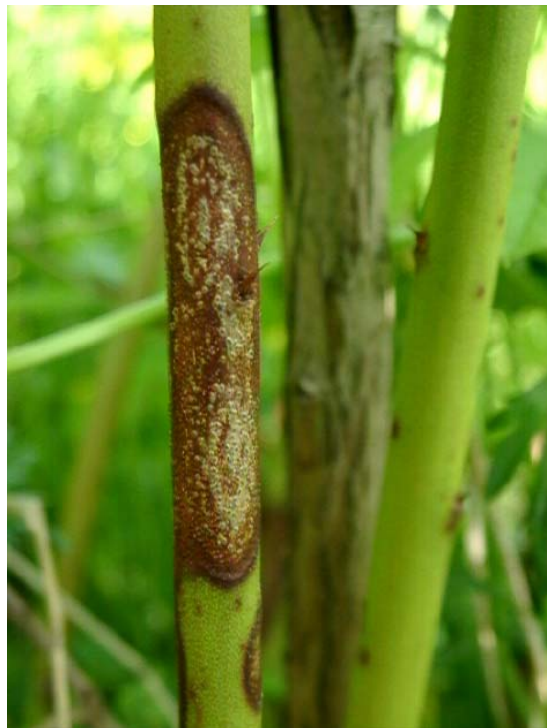
Fig. 1. Canker spot and pycnidia of T. myrtilli Ryc. 1. Plama zgorzelowa i piknidia T. myrtilli