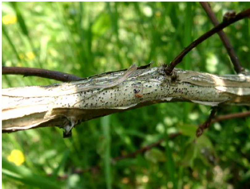
Fig. 3. Necrosis and cracks of the bark of highbush blueberry stems and pycnidia of Phomopsis sp. and Phoma sp.