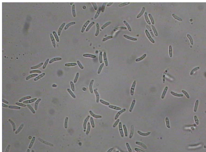
Fig. 2. Conidia of T. myrtilli , 750× Ryc. 2. Konidia T. myrtilli , 750×