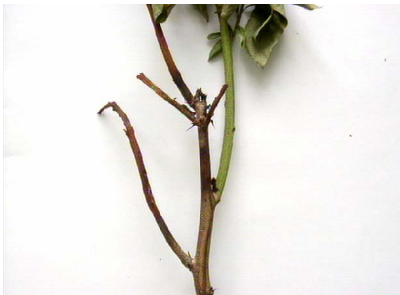
Fig. 4. Necrosis of stem tops caused by B. cinerea