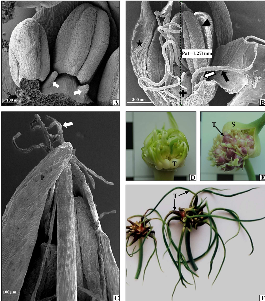
Fig. 3. Allium sativum : A–C – elements of a single flower (SEM) from approximately 30 × 30 mm inflorescences; D–F – inflorescences. A – young stamens with two filament appendages (arrows); B – a single flower with the perianth (star), anthers (arrowhead), elongated filament appendages (arrow), non-elongated filament appendages (white arrow), and pistil (cross); C – filament appendages (arrow) growing over the perianth (P); D – inflorescence size 15 × 15 mm without the spathe, bulbils (T); E – mature inflorescence size 30 × 30 mm with a ruptured spathe (S), bulbils (T); F – 2 inflorescences after early removal of spathe during inflorescence development, visible elongated bulbils (T)