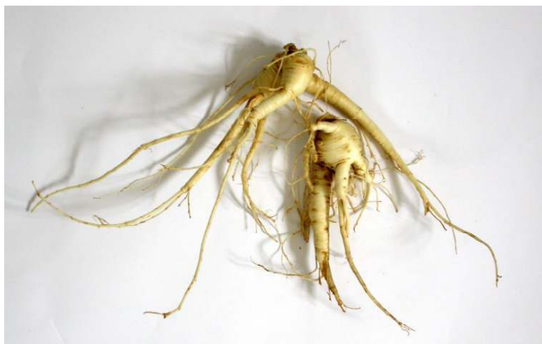
Photo 1. Necrosis of the ginseng roots Fot. 1. Nekroza korzeni żeń-szenia pięciolistnego