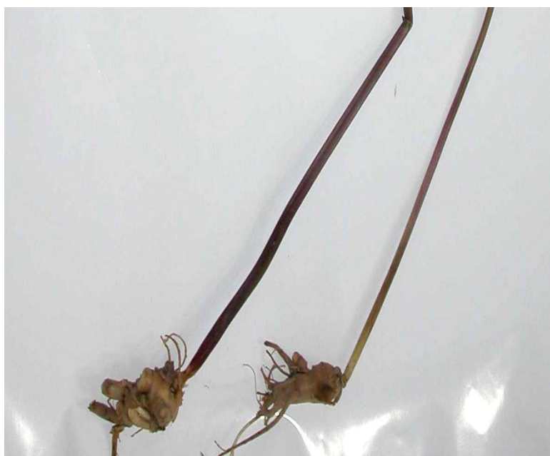
Photo 2. Necrosis of the roots tissues and narrowing of the ginseng stems Fot. 2. Nekroza tkanek korzeni i przewężenie łodyg żeń-szenia pięciolistnego