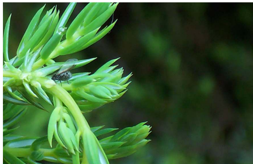
Photo 2. Winged specimen of Cinara juniperi De Geer on Juniperus communis L.

Fot. 1. Bezskrzydła mszyca Cinara juniperi De Geer na Juniperus communis L.