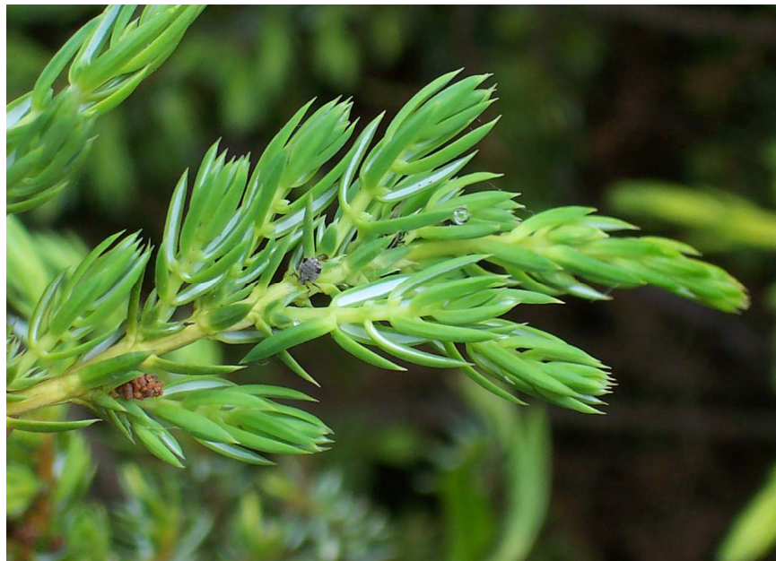
Photo 1. Apterous Cinara juniperi De Geer on Juniperus communis L.

Fot. 1. Bezskrzydła mszyca Cinara juniperi De Geer na Juniperus communis L.