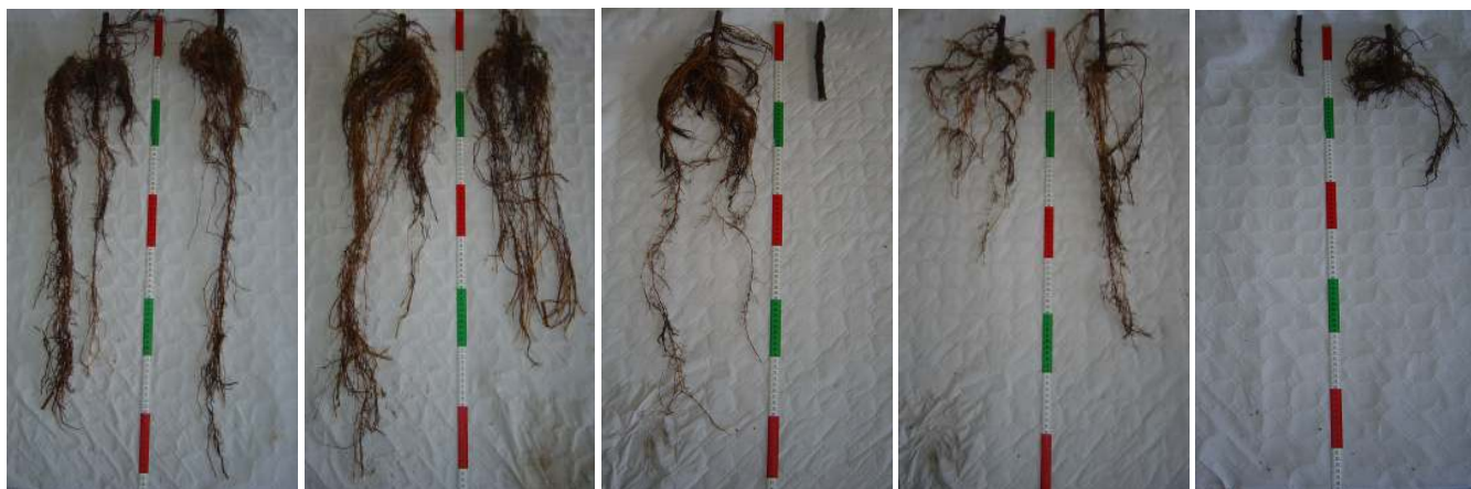
Locality 1 Stanowisko 1