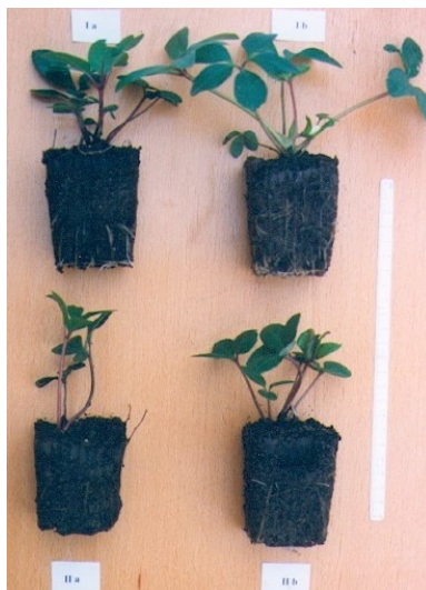
Fig. 1. Quality of christmas rose young plants depending on pricking seedlings to pots or to multiple pots: I – seedlings pricked at the stage of the first leaf, II – seedlings pricked at the stage of the second leaf, A – nipping off roots, B – rolling roots

Rys. 1. Jakość rozsady ciemiernika białego w zależności od pikowania siewek do doniczek lub komórek wielodoniczek: I – siewki pikowane w stadium pierwszego liścia, II – siewki pikowane w stadium drugiego liścia, A – korzenie uszczykiwane, B – korzenie zwijane