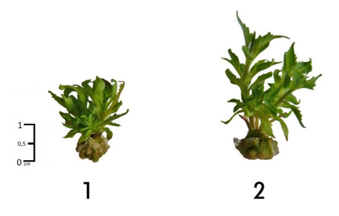
Fig. 3. Microcuttings of dahlia obtained after 8 weeks of cultivation on MS media: (1) BA 2.0 mg \cdot dm<sup>-3</sup>, (2) BA 2.0 + GA<sub>3</sub> 5 mg \cdot dm<sup>-3</sup>

* Values with the same letters in columns do not differ significantly at p = 0.05