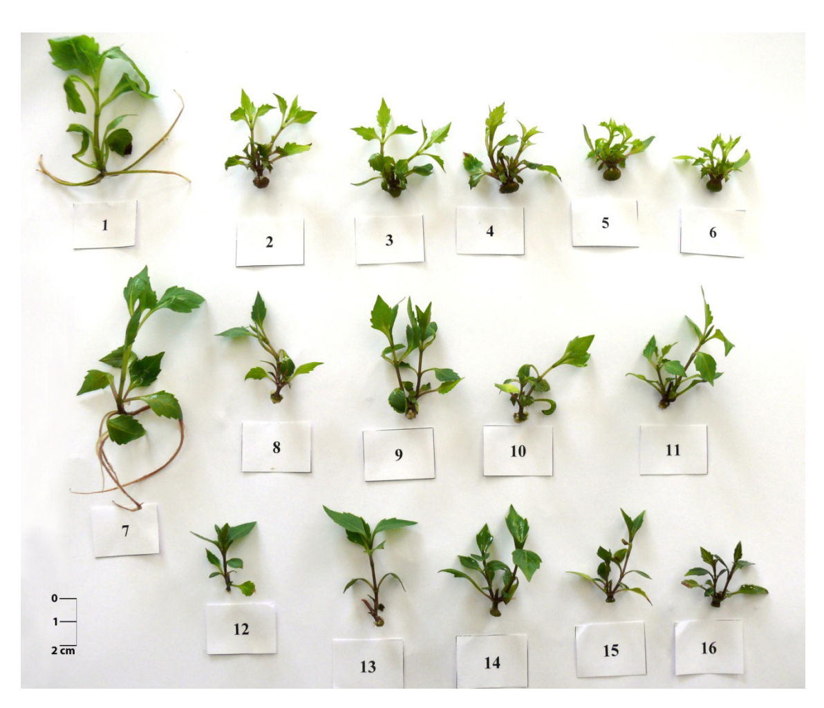
Fig. 2. Microcuttings of dahlia obtained from nodal explants after 8 weeks of cultivation on MS media: (1) control medium without cytokinins, (2) BA 0.25, (3) BA 0.5, (4) BA 1.0, (5) BA 2.0, (6) BA 4.0, (7) KIN 0.25, (8) KIN 0.5, (9) KIN 1.0, (10) KIN 2.0, (11) KIN 4.0, (12) 2iP 0.25, (13) 2iP 0.5, (14) 2iP 1.0, (15) 2iP 2.0, (16) 2iP 4.0 mg·dm<sup>-3</sup>

in concentration of 0.25 mg·dm<sup>-3</sup> (8.0). In this combination 53% of axillary shoots was over 6 mm long. Increase of BA concentration up to 2 or 4 mg·dm<sup>-3</sup> did not significantly influence the number of axillary shoots (Tab. 3, Fig. 2).