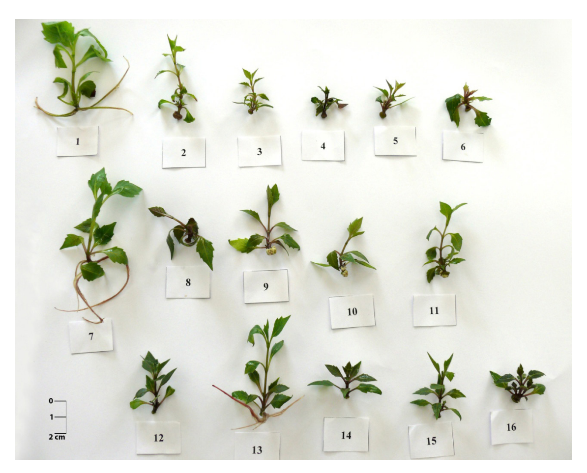
Fig. 1. Microcuttings of dahlia obtained from shoot tip explants after 8 weeks of cultivation on MS media: (1) control medium without cytokinins, (2) BA 0.25, (3) BA 0.5, (4) BA 1.0, (5) BA 2.0, (6) BA 4.0, (7) KIN 0.25, (8) KIN 0.5, (9) KIN 1.0, (10) KIN 2.0, (11) KIN 4.0, (12) 2iP 0.25, (13) 2iP 0.5, (14) 2iP 1.0, (15) 2iP 2.0, (16) 2iP 4.0 mg·dm<sup>-3</sup>