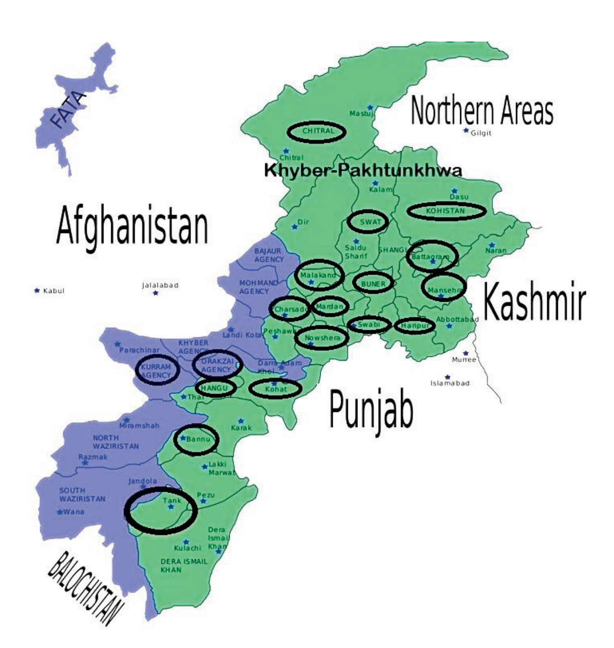
Fig. 1. Geographical locations of collected Brassica rapa germplasm used in the study. The circles denote the areas from where seed samples were collected. The green color shows different districts of Khyber Pa-khtunkhwa, while the blue color highlights former Federally Administrated Tribal Areas (FATA) of Pakistan

Allele scoring and data analysis. The PCR products produced several bands after running on agarose gel. A DNA ladder of known size was used for the comparison of bands. Bands were scored as bi-variate (1–0) data matrix, where 1 designate the occurrence of