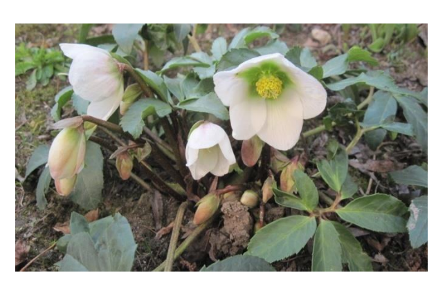
Fig. 5. The first flowering of H. niger plants after 1 year from the acclimatization ex vitro of microplants.

The results presented by Orlikowska et al. [2013] showed that inoculation of H. niger shoot cultures with the bacteria Burkholderia phytofirmans stimulated root formation. The best rooting rate (100%) was obtained for shoots which had been induced for root formation on a medium with 3 mg 1<sup>-1</sup> IBA and 1 mg l<sup>-1</sup> NAA, and then inoculated with B. phytofirmans. This bacterial species produces indole--3-acetic acid (IAA) and shows strong plant growthpromoting effects [Weilharter et al. 2011]. Lower rooting rates of H. niger in vitro were found in the shoots inoculated with B. phytofirmans (95%) and in the shoots growing on media with 3 mg 1<sup>-1</sup> IBA and 1 mg l^{-1} NAA (94%), or without auxins (83%). There is no information on the survivability of rooted shoots in ex vitro conditions [Orlikowska et al. 2013].