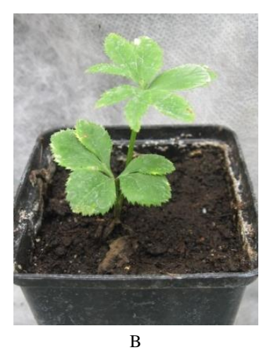
Fig. 4. Young plants (six months old) of Helleborus ni ger L. (A) and Helleborus purpurascens Waldst. et Kit. (B) propagated in vitro .