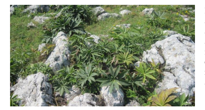
Fig. 1. Hellebores growing in its natural habitat in the mountains of south-western Serbia.