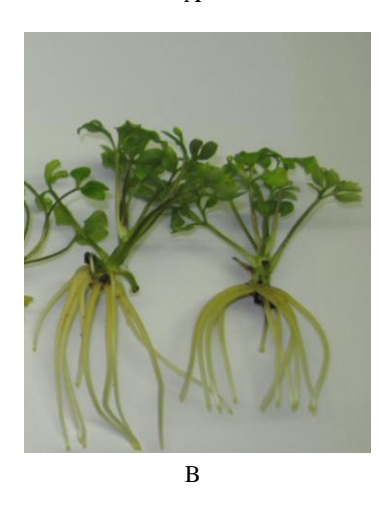
Fig. 3. Overview of the Helleborus purpurascens (A) and Helleborus niger (B) in the rooting stage

Shoots of the Helleborus purpurascens were rooted on the media supplemented with sucrose 30 g l-1 and KNO3 + NH4NO3 (50% according to the MS medium) at temperature +20°C and Helleborus niger shoots rooted on the media with 70 - 80 g l-1 sucrose and KNO3, NH4NO3 (100% according to the MS medium) at temperature +20°C. For rooting purposes, the single shoots were on the media with 50% or 100% of nitrogen salts (according to the MS medium – KNO3, NH4NO3) supplemented with IBA 1 mg l-1 and NAA 0.1 mg l-1