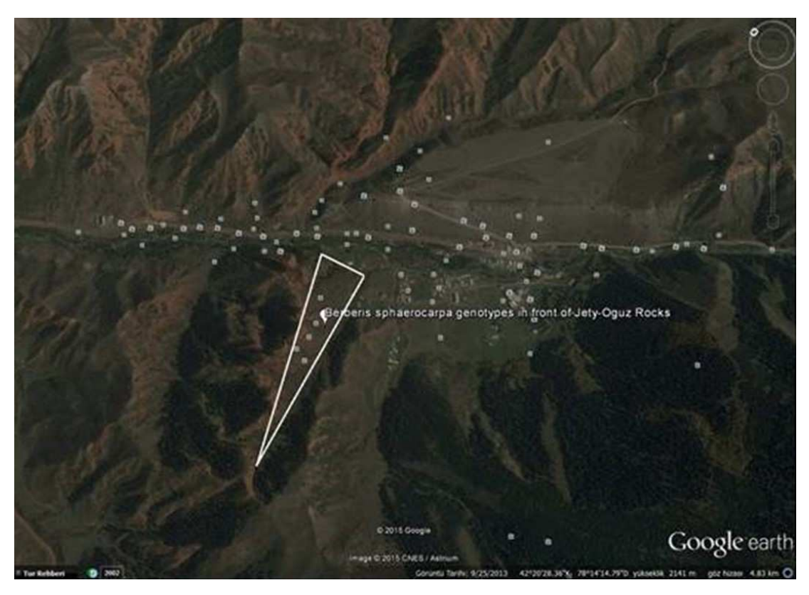
Fig. 5. Berberis sphaerocarpa genotypes' distribution area in this study