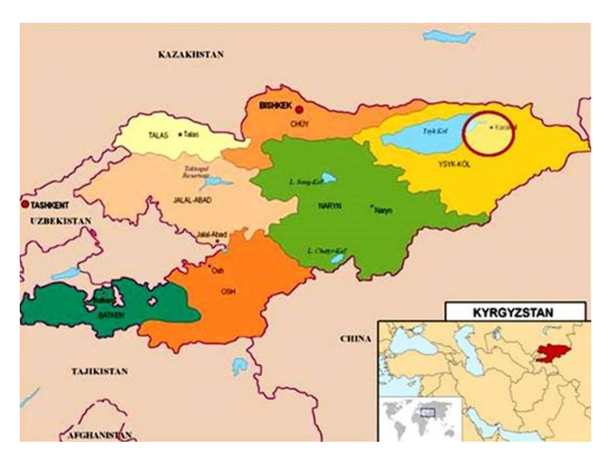
Fig. 4. Jeti-Oguz district of North Eastern Kyrgyzstan

Statistical analysis. Means and standard deviations for pomological characteristics were determined by using Microsoft Office Excel software.