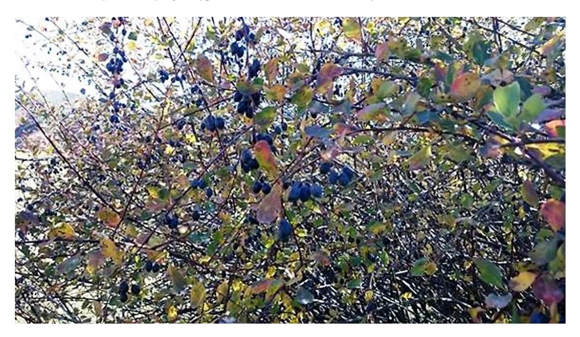
Fig. 6. Berberis sphaerocarpa shrub with fruits