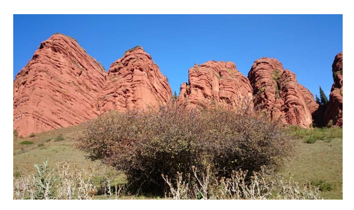
Fig. 1. Naturally grown Berberis sphaerocarpa shrub of Jeti-Oguz

altitude mountains and over the stream and river banks of Tajikistan. The relevant sites have almost identical ecologies. In these regions, winter temperatures may reach to -30°C and even below.