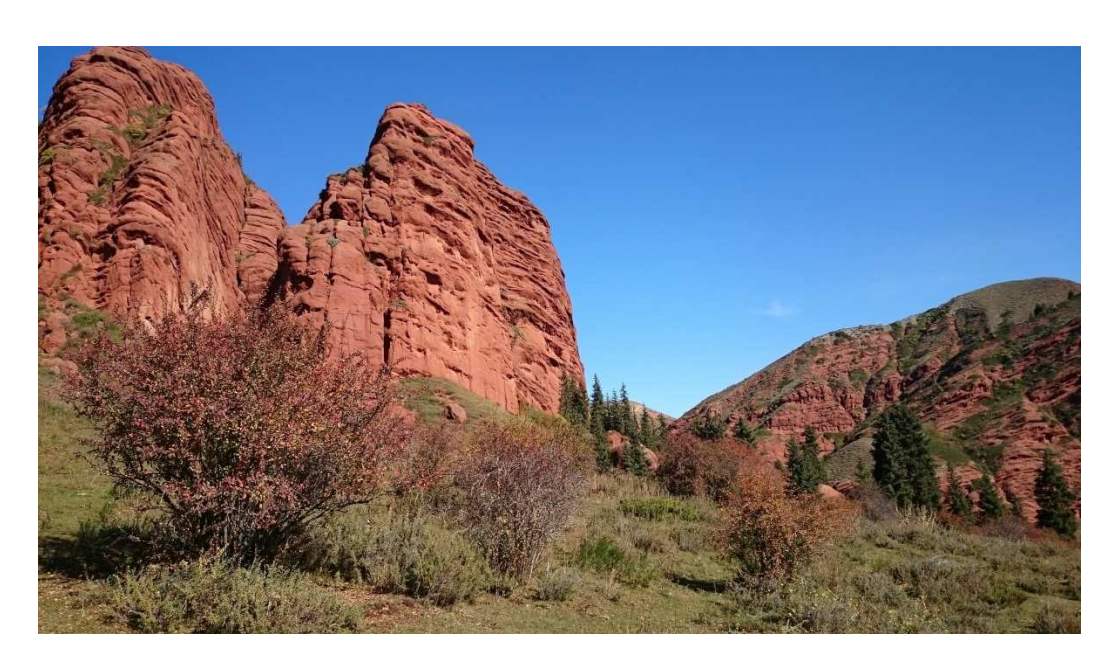
Fig. 3. Different spherical-fruited barberry genotypes in front Jeti-Oguz rocks

Beside winter colds, berberis species are quite resistant to high temperatures and air pollution; they require ample amounts of light [Dzhangaliev et al 2002]. Berberis species have around 500 cultivars and they are common under natural conditions in Europe, Asia, North-eastern Africa and South America [Ahrendt 1961]. There are some cultured cultivars of barberry and they are commonly used as food stuff, drug and decorative plant.