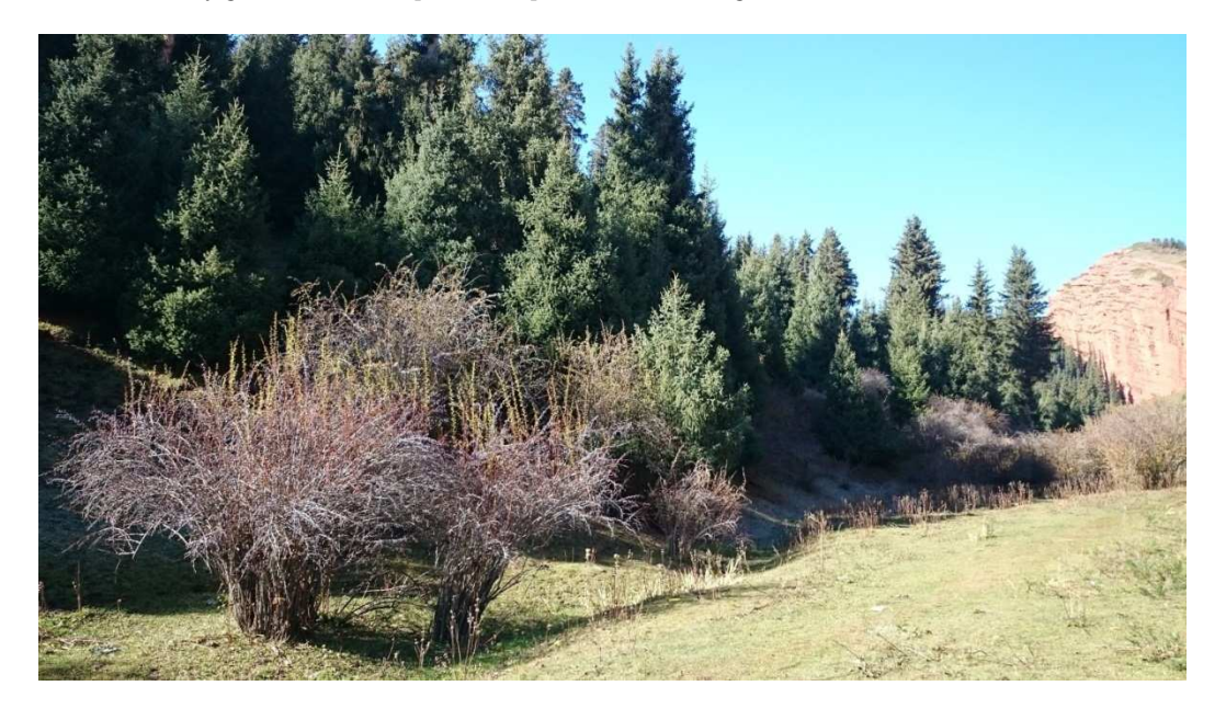
Fig. 2. Berberis sphaerocarpa shrubs near the pinewood forest