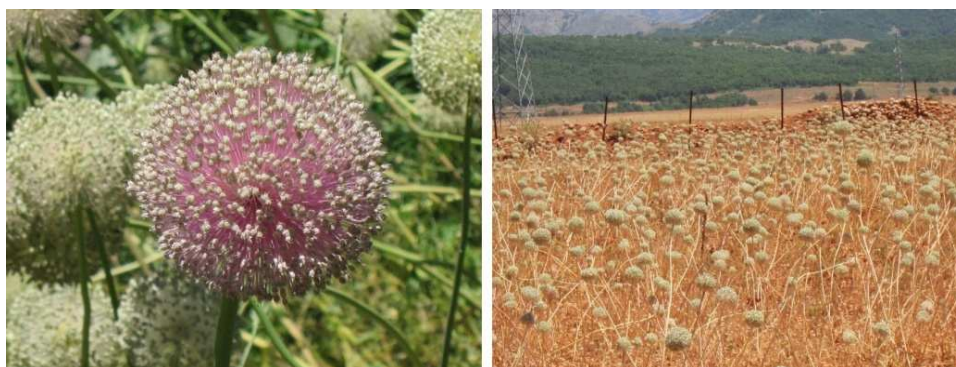
Fig. 2. Tunceli garlic production at Ovacik district of Tunceli under local farmer's patronage