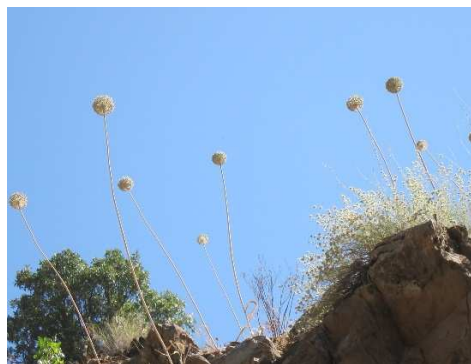
Fig. 1. Tunceli garlic growing at its habitat near Ovacik (Tunceli) under natural conditions on rocky slopes

Allium tuncelianum bulbs used in the study were obtained from local traders at Ovacik district of Tunceli province (39°16'N; 39°26'E; 1050 m a.s.l.), Turkey (fig. 1) during the month of August 2011 and were freshly harvested; that were previously collected from wild flora by locals. These bulbs had mean bulb diameter of 3.28 cm, mean bulb weight of 17 g and mean bulb circumference of 11.2 cm (mean of 20 bulbs).