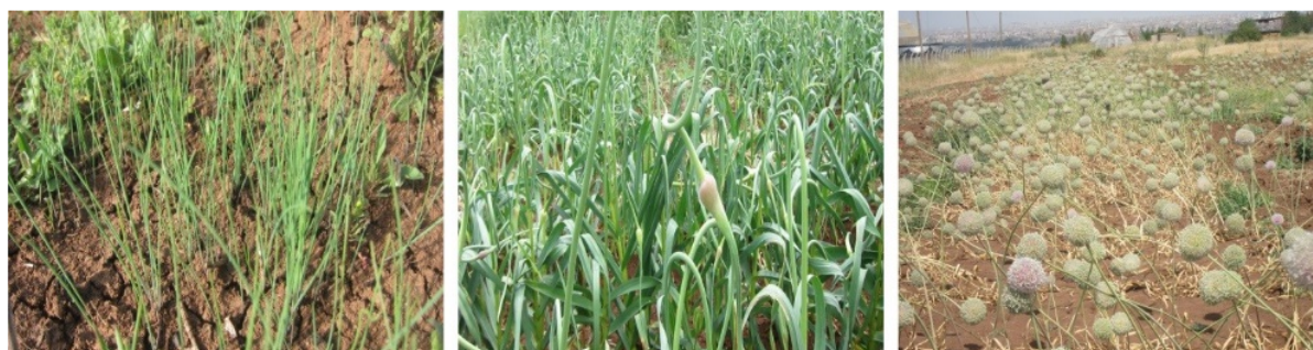
Fig. 3. Tunceli garlic production at the experimental station of Dicle University, Diyarbakır