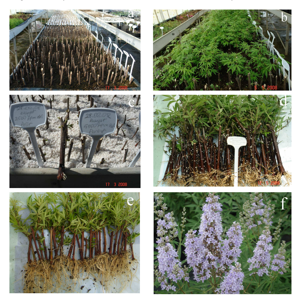
Fig. 3. Different stages in the rooting experiments of V. agnus-castus cuttings. a – the beginning of Exp. II, b – towards the end of Exp. II, c – a 17-days-control cutting in perlit, d – the rooted cuttings inserted in perlit and treated with 5000 mg l<sup>-1</sup> IBA in Ex. II, e – rooted cuttings in 1 cm diameter, f – vegetatively propagated a V. agnus-castus plantlet through the work

Güleryüz [1999], Guo et al. [2009], Zhang et al. [2009] and Ciubotaru and Roshca [2011] for Prunus persica, Rosa spp. (rose hips), Paeonia 'Yang Fei Chu Yu', Feijoa sellowiana and Thuja occidentalis 'Danica', respectively. Among the limited literature on in vivo adventitious rooting of V. agnus-castus , Alkurdi et al. [2013] set up two experiments on January 12 and 26 May to compare the effect of different culturing time, substrate and cutting type. The culture conditions and observation parameters of their study are quite different than those of present study. They used soft and semi-hardwood cuttings without any PGR treatment. Also, their observation criteria did not include rooting ratio (%). However, they determined the increase in number of roots and root length on January 12 and in number of branches and leaves on 26 May.