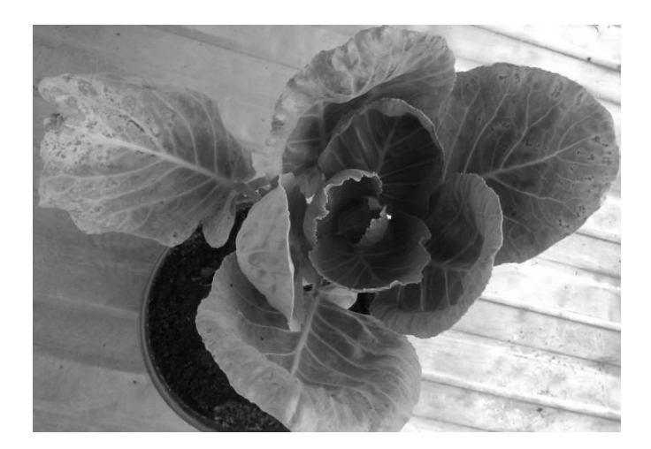
Fig. 2. Brassica oleracea var. capitata subvar. alba L. showing necrotic spots symptoms

On the basis of disease rating scale (0-5) and ELISA tests, breeding lines were grouped as highly resistance (HR), resistance (R), moderately resistance (MR), moderately susceptible (MS) and susceptible (S). Of the lines tested, 9 (39.1%) were categorized as highly resistant, 1 (4.3%) as resistant, 7 (30.4%) as moderately resistant, 2 (8.6%) as moderately susceptible and 4 (17.3%) as susceptible (tab. 1).