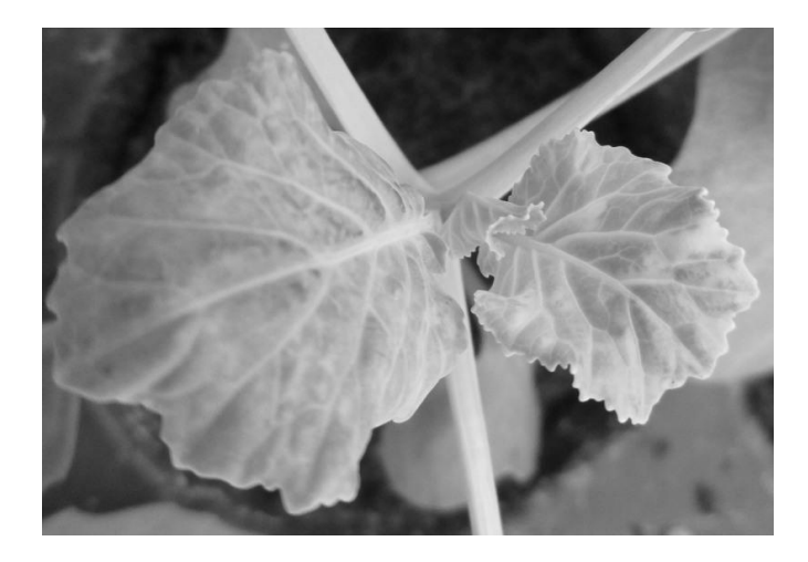
Fig. 1. Brassica oleracea var. capitata subvar. alba L. showing mosaic symptoms