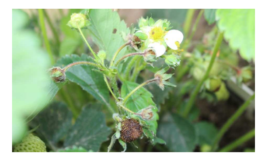
Phot. 1. Anthracnose symptoms on flowers and green fruits

Based on disease index, mycological analysis and obtained yield, the tested cultivars were classified into four groups of susceptibility: relatively resistant, of low susceptibility, moderately susceptible and highly susceptible. As the result of inoculation with the mixture of C. acutatum isolates it was stated, that all cultivars were more or less susceptible but in different degree.