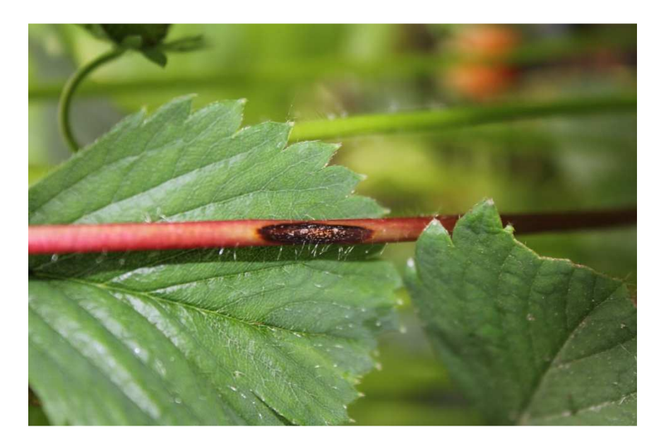
Phot. 3. Anthracnose symptoms on petioles

The disease and etiological symptoms (necrosis and pink-coloured spores) were observed on flowers, leaves, stolons, green and ripe fruits of all inoculated with C. acutatum cultivars (phot. 1–4). The intensity of disease expressed as disease index ranged from 8.0% to 62.0% during the years of investigations (tab. 1). The lowest values of disease index were noticed in the first year of investigations and they increased gradually in next years. The disease index for cv. 'Senga Sengana' was the lowest and amounted respectively to 8.0, 9.5 and 11.5% during the years of the study. The highest values of disease index were noticed for cv.'Camarosa' and amounted to 33.0, 45.0 and 62.0% respectively in 2012, 2013 and 2014. The mean values of disease index for cvs. 'Honeoye' and 'Darselect' were lower by a half than that for cv. 'Camarosa' and amounted to 23.16 and 24.33%, respectively. The cvs. 'Elsanta', 'Florence', 'Selva' and 'Alfa Centauri' were more susceptible, the mean values of disease index were 30.5, 29.16, 32.0 and 33.83%, respectively. In control combinations the values of disease index were low and ranged from 1.5% for 'Senga Sengana' in 2012 to 7.0% for cv. 'Camarosa' in 2014 (tab. 2).