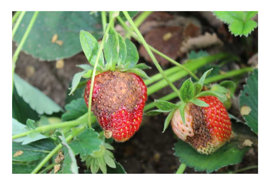
Phot. 2. Anthracnose symptoms on ripe fruits – brown lesions with pink spore masses