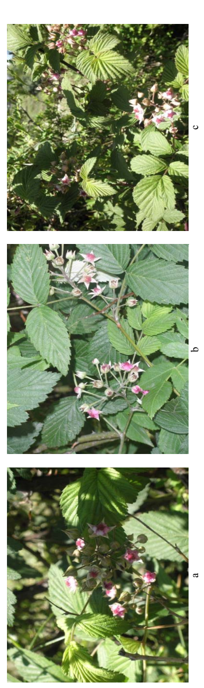
Fig. 1. Flowering stage of wild raspberry germplasm from different locations; (a) Topa, (b) Banjonsa, (c) Neriyan Sharif