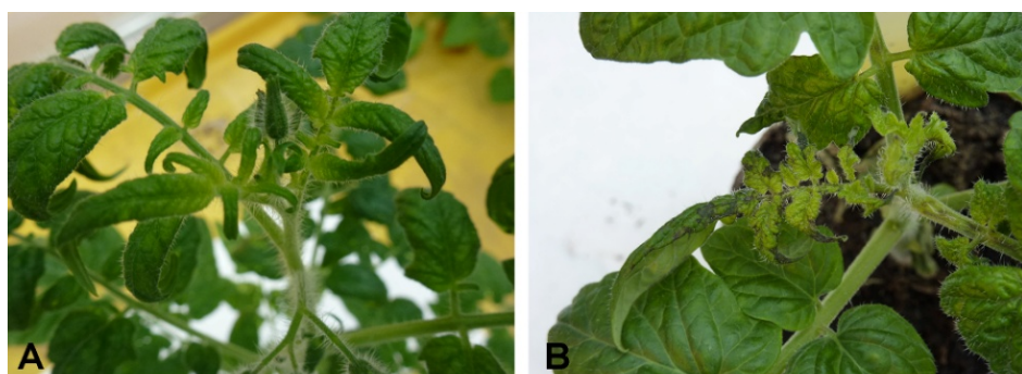
Fig. 2. Cross-protected tomato plants: a – infected with PepMV-P22 and then challenged by PepMV-P5-IY, b – infected with PepMV-P22 and then challenged by PepMV-P19. Both photos were taken two months after infection

PepMV presence. The presence of PepMV in treatments was confirmed by RT-PCR. Mock- inoculated plants were virus-free. Cloning and sequencing of the TGB3 and CP regions confirmed the establishment of protector and challenge isolates in the cross-protection treatments. Interestingly, after two months of infection with challenge isolates in plants co-inoculated with PepMV-P5-IY only the CP sequences typical for PepMV-P22 were observed. In plants inoculated with necrotic variants the ratio of clones bearing wild type variants of TGB3 versus the necrotic variants was 4:6.