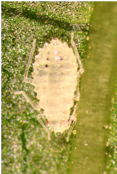
Phot. 1. Larva of the plant louse (aphid) Chromaphis juglandicola (Kalt.) Fot. 1. Larwa mszycy Chromaphis juglandicola (Kalt.)