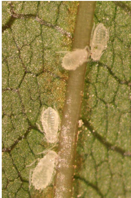
Phot. 2. Plant lice (aphids) Chromaphis juglandicola (Kalt.) preying in dispersion on the bottom side of Juglans regia L. leaf blade Fot. 2. Mszyce Chromaphis juglandicola (Kalt.) żerujące w rozproszeniu na spodniej stronie blaszki liściowej Juglans regia L.

In the C stand the numerical strength of aphids, as compared to the two remaining stands, was significantly lower (tab. 3). The first specimens of the examined plant louse species were collected after the 20 th day of May. Its peak number, which was 18 pcs.:100 leaves -1 , occurred in the 2 nd decade of July, and the last aphids were observed in the 3 rd decade of October.