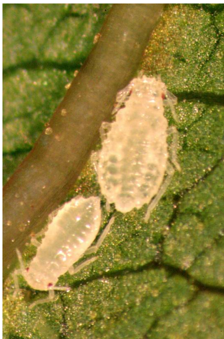
Phot. 3. Damages caused by preting of Chromaphis juglandicola on the leaf of Juglans regia L. Fot. 3. Uszkodzenia powodowane żerowaniem Chromaphis juglandicola na liściu Juglans regia L.

On the B stand first specimens of Ch. juglandicola were observed in the 1 st decade of May. In the same period the most numerous specimens of aphids were collected (peak number) and their numerical strength equaled 49 pcs. 100 leaves -1 . From mid-May to the end of June the plant lice settled J. regia , in much smaller numbers and in July the trees were free from aphids. This study period was frequently accompanied by storm-like precipitations and. Additionally, in July – temperatures above 30°C, which could just as well explain the above-described situation (tab. 2).