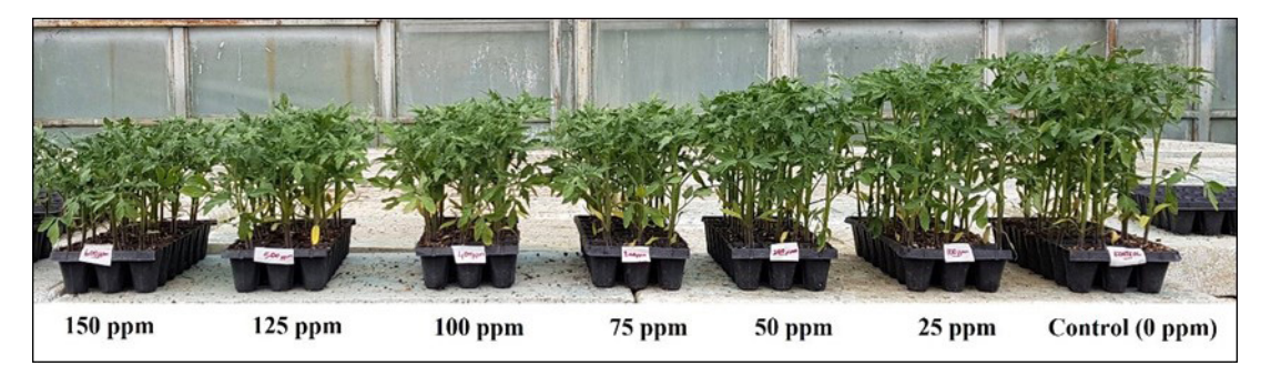
Fig. 2. Tomato seedlings to which tebuconazole was applied at different doses and to be sowed

stem diameter (mm), leaf dry matter content (%), stem dry matter content (%) and root dry matter content (%) and leaf chlorophyll content (SPAD) were measured to determine the seedling development. Seedling height (cm) and stem height (cm) were measured with tape measure and stem diameter (mm) was measured with a digital calliper. Leaf chlorophyll content was measured using SPAD (Chlorophyll Meter SPAD-502Plus, Konica Minolta). Prior to the measurement of the root height, the roots were washed thoroughly without any root loss and measured in cm with the help of a tape measure. In order to determine the dry matter contents in seedlings, ten seedlings were taken randomly and leaves, stems and roots were dried outdoors for one week after the wet weight was determined. They were then dried at 105°C in an oven for 24 hours and weighed [AOAC 1980]. The wet and dry weights were determined using a scale with 0.01 g precision and dry matter content (%) was determined with the following formula [Kılıç et al. 1991]: