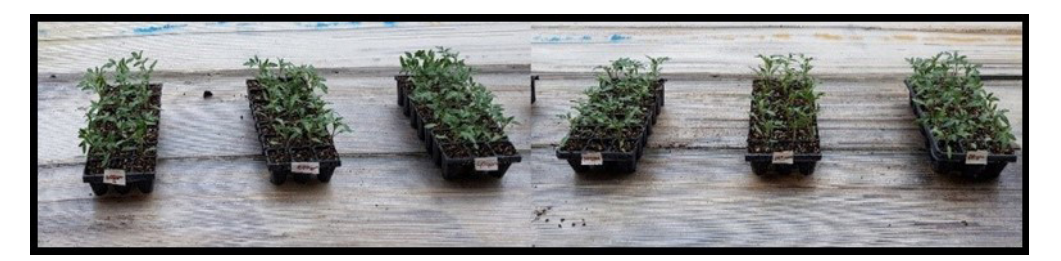
Fig. 1. Tomato seedlings to which tebuconazole will be applied at different doses