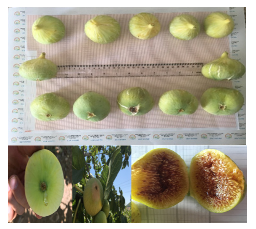
Fig. 3. Images of 'Abbas' fig variety

Detection wavelength were 280 nm and 360 nm. Elution was carried out using a nonlinear gradient of the solvent mixture 2.5% formic acid in water (solvent A) and 2.5% formic acid in acetonitrile (solvent B).