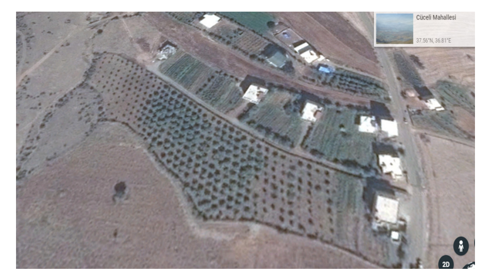
Fig. 1. General view of the research parcel (source: Turkish Land Registry and Cadastre Information System (TAKBiS) webpaige)