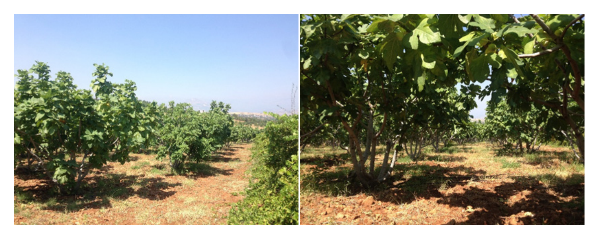
Fig. 2. General view of the research garden